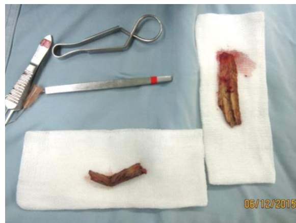
Fig 4. Two wooden sticks extracted from orbital cavity

Exploration of the orbital cavity revealed another wooden foreign body without intracranial extension (fragment II) (Fig.4). The ophthalmologist evacuated the wooden foreign body by pulling it out of the orbital cavity, and superior rectus muscle appeared avulsed. After all wooden foreign bodies were evacuated, superior eyelid could be repositioned to its anatomical position and appeared the eyelid was lacerated in a size of 2 x 3.5 cm. The laceration was then sutured with prolene 6.0. Patient was given broad-spectrum antibiotics.