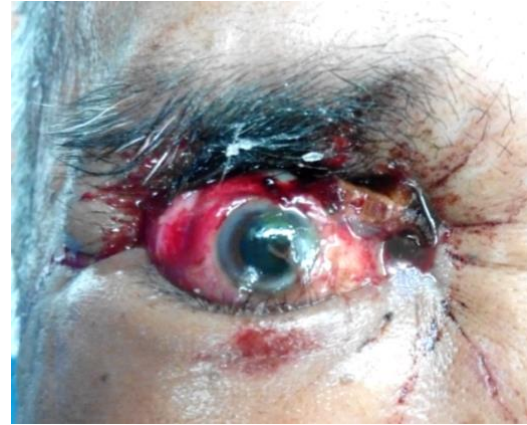
Fig 1. Protruded globe and inwardly folded upper eyelid

A 53-year old man presented to our emergency department after he cut a wooden log with an electric rotating saw and a wooden stick penetrated his head through his right eye. He complained of pain in his right eye with significant decreased of vision. He was conscious (Glasgow Coma Scale 15/15), and his vital parameter was of 110/60 mmHg for blood pressure, 20x/min respiration rate and 88x/min heart rate and afebrile at the point of presentation. Physical examination revealed a protruding eyeball with wooden stick protruding out through the medial portion of his right eye (Fig.1).