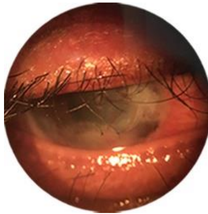
Figure 5. Patient's right eye after the application of AMT

The amniotic membrane transplant graft procedure on the patient's right eye produced a good result, with an intact AMT after a few days, it also helped preventing the prolapse of the cornea while patient underwent the methylprednisolone injection. Orbital wall decompression will be planned after the thyroid function is stable.