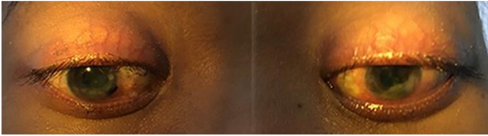
Figure 4. Anterior segment of patient's eyes after 6 weeks of high dose intravenous methylprednisolon injection

The amniotic membrane transplant graft procedure on the patient's right eye produced a good result, with an intact AMT after a few days, it also helped preventing the prolapse of the cornea while patient underwent the methylprednisolone injection. Orbital wall decompression will be planned after the thyroid function is stable.