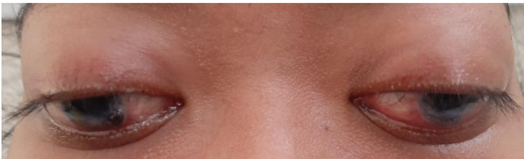
Figure 1. Macro appearance of anterior segment of both eyes

She had a history of thyroid disease for 9 years, and had undergone therapy in Endocrine division of Pediatric Outpatient clinic for only 2 years, but was left without treatment for the rest 7 years due to her family's economic condition. She felt that her eyes were protruding since 9 years ago, but worsened for the last 2 months. There were also swelling and redness of her eyelid of both of her eyes.