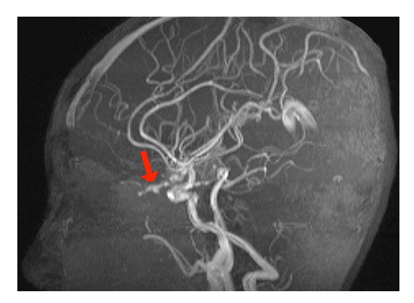
Figure 2B. The axial view of brain MRA showed the extended AVM at the retrobulbar area of the right eye (red arrow).