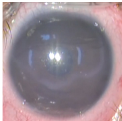
Fig 1. The patient was presented with buphthalmos and Haab striae

A 6 month old male baby presented to our hospital with a chief complaint of enlargement of the left eye since 1 month before admission. He was referred by his pediatrician due to buphthalmos and epiphora. There was slight blepharospasm and photophobia. The parents reported that despite the enlargement of the left eye, both of the eye coordinated symmetrically. There was no family history of glaucoma and consanguinity. The pregnancy and delivery history of the patient were unremarkable. The patient had 2 siblings and both of his siblings had normal growth and development. The ophthalmological examination found good light and object fixation on both eyes. The eyes were orthophoric. There was no nystagmus and movement restriction on both eyes. The corneal diameter of the right eye was 10 mm and the left eye was 13 mm. Haab striae was found on left eye cornea (figure 1).