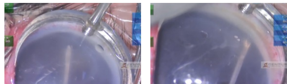
Fig 4. Goniotomy was performed in 180° of the angle using a needle knife and gonioscope for angle visualization

We performed the goniotomy in 180° of the angle using a needle knife. A gonioscope was used to visualize the angle. Fundus examination of the left eye revealed good optic nerve with thick rim and cup to disk ratio 0.5. The antiglaucoma medication was stopped after completion of the surgery.