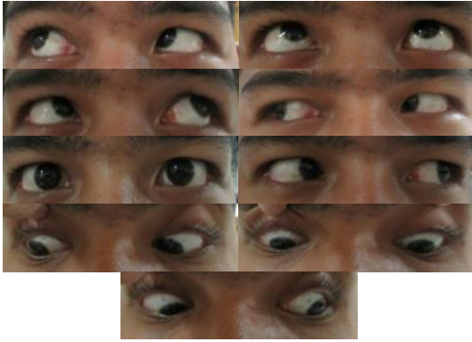
Fig 4. Photographs of eye movement 6 months after trauma show abduction limitation with normal adduction of the right eye