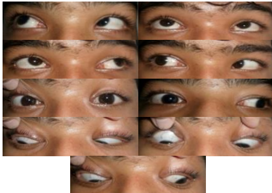
Fig 1. Photographs of eye movement show adduction and abduction limitations of the right eye 2 days after head trauma

Best-corrected visual acuity on both eyes were 6/6. Pupils were normal and no relative afferent pupillary defect was found. There was adduction deficit of contralateral gaze on the right eye associated with an abducting dissociated horizontal nystagmus on the left eye. Both eyes adducted normally in convergence. These signs were consistent with INO. He also had a moderate underaction of ipsilateral abduction on the right eye and overaction on down gaze (Figure 1). On up gaze, both eyes were found to have vertical nystagmus. Anterior segment revealed normal limit, except minimal chemosis on the right eye. The fundoscopic examination result of both eyes were within normal limit.