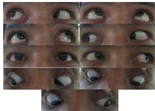
Fig 3. Photographs of eye movement show adduction and abduction improvement of the right eye 2 weeks after head trauma

There was no specific management for this patient. Observation with conservative management by giving neuroprotector agent was done. There was improvement of ocular movement in 2 weeks after treatment (Figure 3).